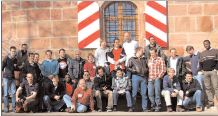
LAST YEAR'S BAND OF BROTHERS AT BURG WERNFELS